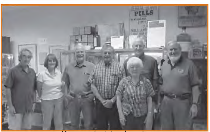
Museum physician docents